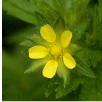
Norwegian Cinquefoil ( Potentilla norvegica L. ssp. monspeliensis (L.) Asch. & Graebn.)

Spent 3 hours on the refuge today. The star of the day was the rain. The day started out in the upper-80's but with high humidity, not dry like I had anticipated. Was able to check out a few things, but then the heavens opened out. Got about 2 inches of rain in two hours, so had to curtail my exploration. Had a successful day regardless.