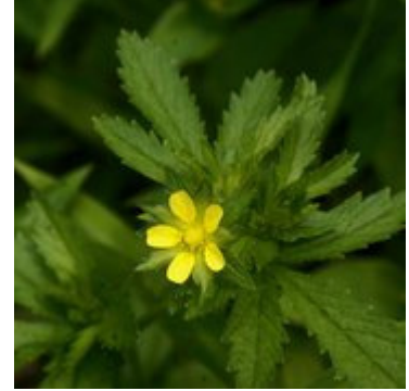
Norwegian Cinquefoil ( Potentilla norvegica L. ssp. monspeliensis (L.) Asch. & Graebn.)

Went to Rogue Harbor and found some Norwegian Cinquefoil ( Potentilla norvegica L. ssp. monspeliensis (L.) Asch. & Graebn.) blooming on the shore. The biggest difference between this Cinquefoil and others in the genus is the fact it has three leaflets. Compared to the others in the genus it