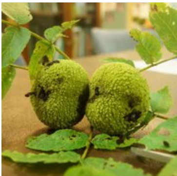
Black Walnut (Juglans nigra L.)

plants to be sure. I will be checking out these plants as the season progresses.