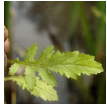
Bog Yellow Cress ( Rorippa palustris (L.) Besser)

Next to the Norwegian Cinquefoil , noticed some Bog Yellow Cress ( Rorippa palustris (L.) Besser) going to seed. There were still flowers on some of the stems, so decided to collect some for the survey. This wet soil loving mustard is native to many parts of North