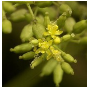
Bog Yellow Cress ( Rorippa palustris (L.) Besser)

is a late bloomer. The Norwegian Cinquefoil is native to Eurasia and North America. There appears to be two forms of this species. Some botanists have split the North American form as a separate species, but more recently, botanists tend to lump the two together and call them separate sub-species. Both forms have been found in North America, one native, one introduced.