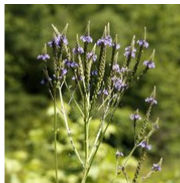
Swamp Verbena ( Verbena hastata L.)

Today went directly to New Marsh. On the backside, found some Swamp Verbena ( Verbena hastata L.). This plant likes to grow on the shores of lakes and ponds. It is an annual that can attain height of over 6 feet. Nurseries sometimes sell it, but it requires a fair amount of moisture to do well. There are three color forms of this species, purple which are pictured here, and pink and white which are rare. It is native to the 48 contiguous states and the lower tier of Canadian provinces, as well as Mexico.