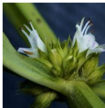
Taperleaf Water Horehound ( Lycopus rubellus Moench) - Maybe

Nearby, spotted some Water Horehound ( Lycopus spp.) just starting to bloom. It is difficult to key species out in this genus especially when they are blooming. It is usually best to wait until they produce seed. Even so, I have tentatively identified these plants as Taperleaf Water Horehound ( Lycopus rubellus Moench) based on the shape of some of the flower parts and the shape of the leaves.